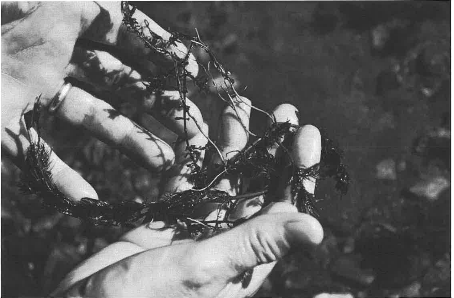
Jim McGrath shows Eurasian milfoil at Pontoosuc Lake.