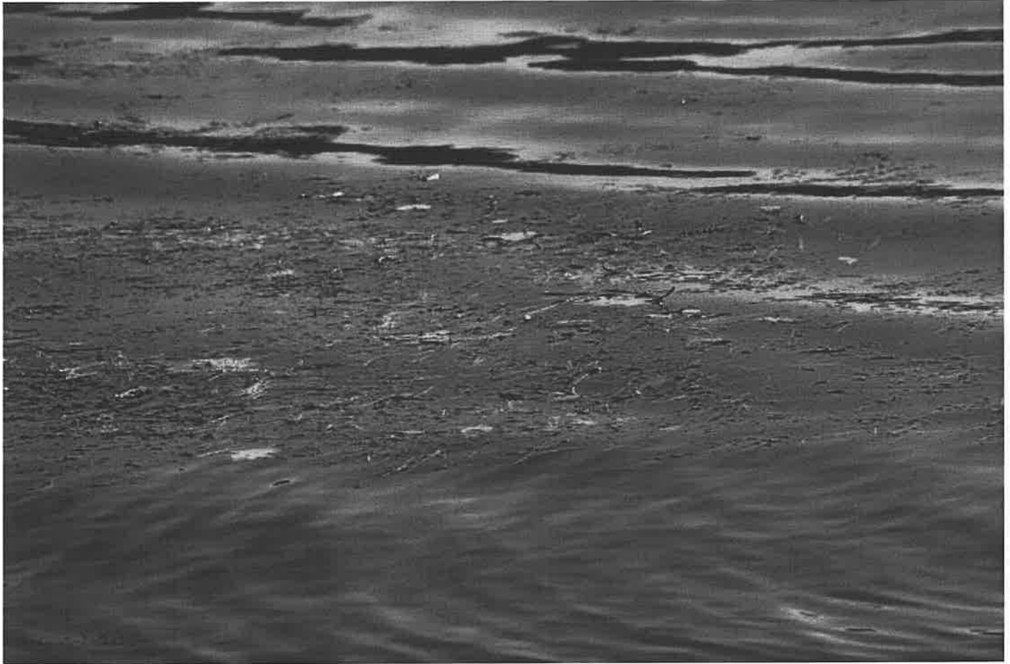
This is weed growth in Pontoosuc Lake in Lanesborough.

This year, weeds were chemically treated with diquat just once, in May, although two other chemicals are allowed. Diquat is a liquid herbicide that kills the plant but not the roots of perennials.